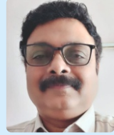
National Vice President