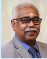
Patron Past National President