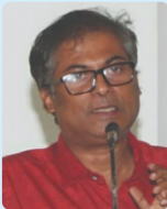
State Vice President