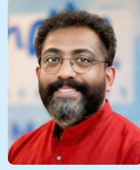
Organising Committee Secretary 9447164644