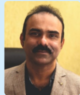
Patron Past State President