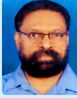
Organising Committee Vice Chairman 9447076654