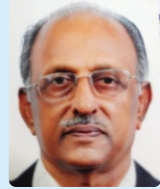
Patron Past National Vice President