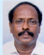
Joint Secretary South Zone