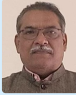
State President Elect