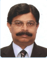
Chief Patron Past National President