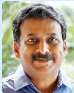
Patron Past State President