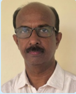
Treasurer & Finance Committee Chairman