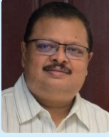
Organising Committee Chairman 9447087766