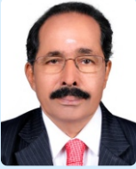
Immediate Past President