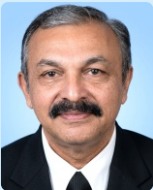
Patron Past State President